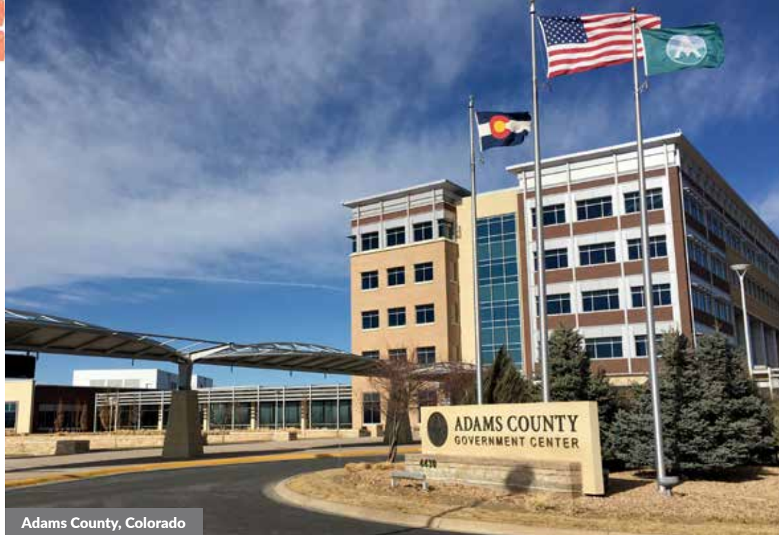
Adams County, Colorado

Broadband access "isn't just an educational challenge—it's a workforce development challenge."